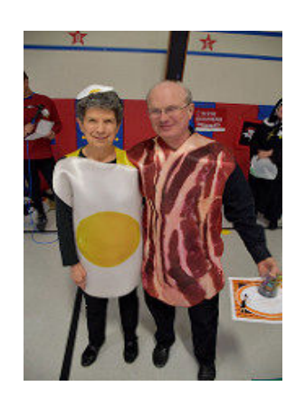
Most Original Bacon and Eggs