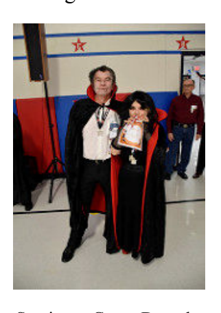
Scariest - Count Dracula