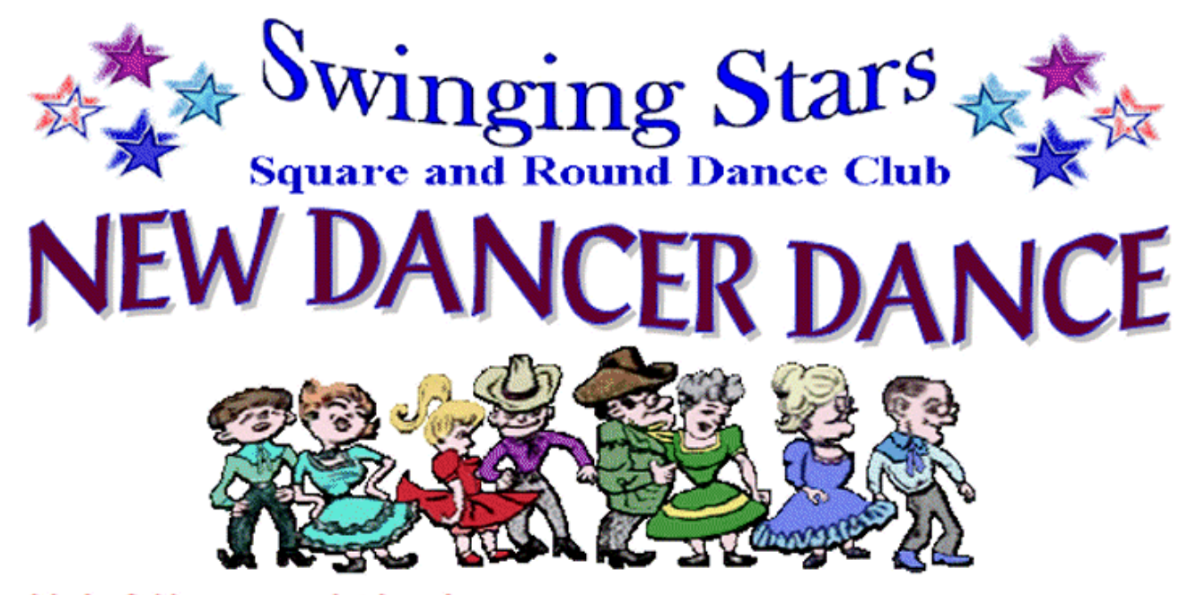
Club Officers and Members: Bring Your New Dancers and Students Students: Please Wear Your Students Badges For Free Admission