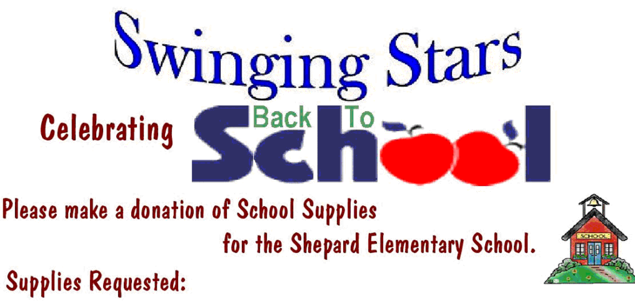
Upcoming Advertised Swinging Stars Theme Dances

Kleenex Boxes, Glue Sticks, Crayons, Markers, and Sandwich Bags